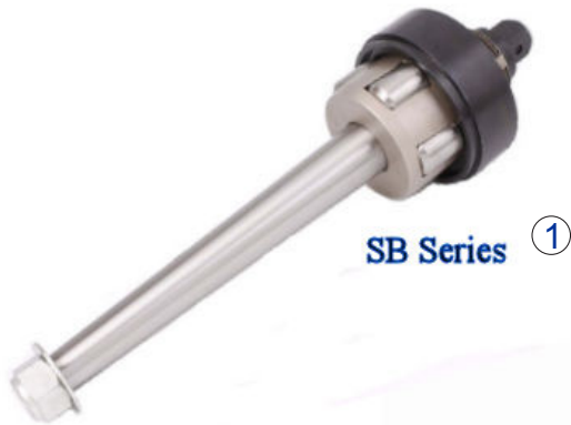
SB Series ①

Please provide the following: Thickness of the tube sheets. Distance between the tube sheets as in the internal measurement. Tube OD and ID including the tube wall thickness.