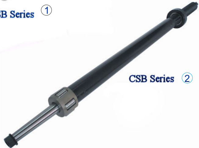
CSB Series ②