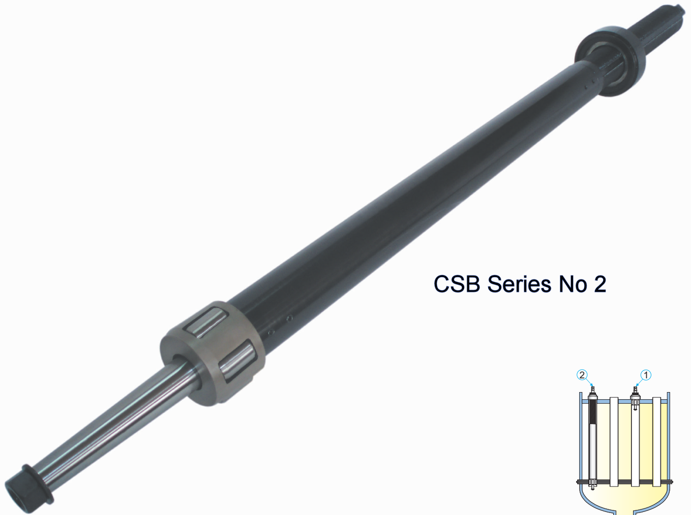
CSB Series No 2

Powermaster Industrial Ltd Tel: (613) 764-0572 sales@tubetools.ca